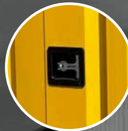
T-LOCK DOOR HANDLE